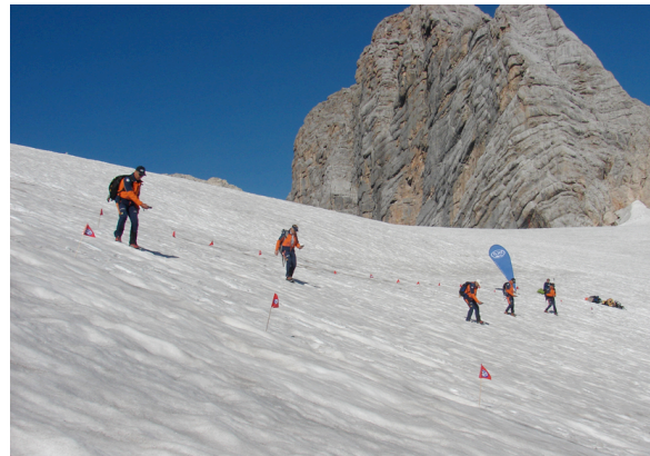
Figure 2. Searching in parallel requires a designated search leader. The search leader must keep the rescuers aligned and restricted to their search strips. They must not commit to the coarse and fine search until their distance reading is less than or equal to their designated search strip width. (Photo of Austria Mountain Rescue Team by Michael Alterdinger.)

In actual avalanche incidents, searching in parallel for multiple victims has shown to be intuitive and effective (Edgerly, 2008), especially when adequate manpower is available for excavating the victims. As long as the victims are not in close proximity, then rescuers naturally end up pinpointing and excavating the victims in parallel rather than in series. If the victims are buried within close proximity, however, then searching in parallel can be less intuitive. This issue can be overcome by adjusting the search strip width between searchers to reflect the number of searchers and width of the debris area rather than using the standard search strip width of 20 (or 40) meters. By reducing the search strip width, then the probability will increase that different searchers will end up excavating different victims, rather than all the searchers being led to the same victim.