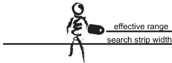
Figure 1. Search strip width is twice the effective range of the transceiver.